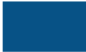
ColorRx ® Dark Blue