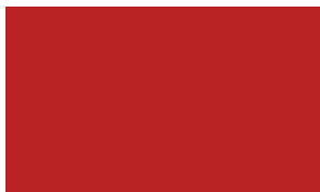
ColorRx ® Red