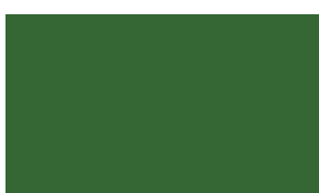
ColorRx ® Dark Green